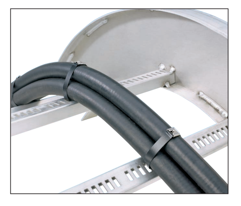
Application Electrical cabling secured to cable tray in harsh environments

Application Secure metal shield over pipe insulation