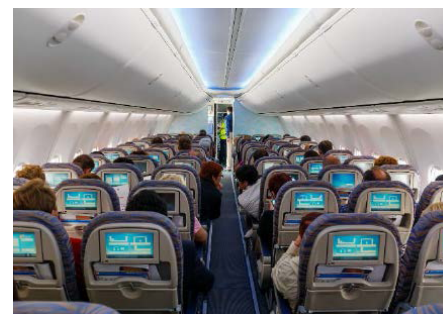
In-Flight Entertainment Systems