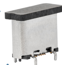
USB 2.0 Type-C Receptacle, Vertical, 16 Circuit (217182 Series)

SMT soldering design • Offers compactness • Enables easy testing with improved yield rate • Eases supplementary soldering on SMT pins