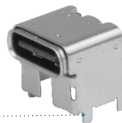
USB 2.0 Type-C Receptacle, Top-Mount, High-Center, 16 Circuit (217180 Series)

Is helpful in aligning high-center line positions