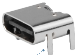
USB Type-C Receptacle, Top-Mount, 6 Circuit (217175 Series)