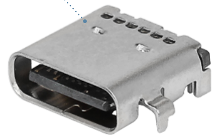
USB 3.2 Type-C Receptacle, Mid-Mount, 24 Circuit (217184 Series)

Hybrid soldering design • Facilitates re-work in case of solder paste fail • Enables easy testing with improved yield rate • Eases supplementary soldering on SMT pins