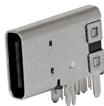
USB Type-C Receptacle, Upright, 14 Circuit (216989 Series)