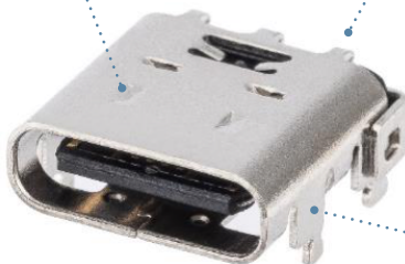
USB 2.0 Type-C Receptacle, Top-Mount, 16 Circuit (213716 Series)

Metal shell Provides strength/robustness to the connector