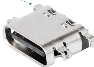
USB 2.0 Type-C Receptacle, Mid-Mount, 16 Circuit (216990 Series)